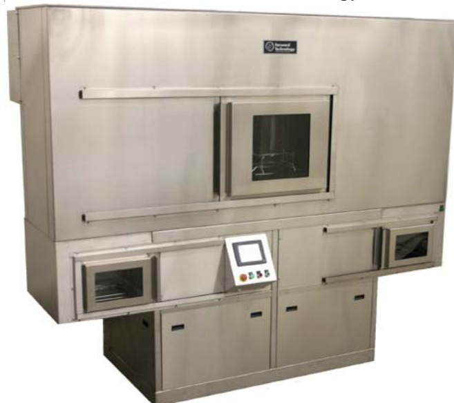
F-300 with optional Automated Transport System