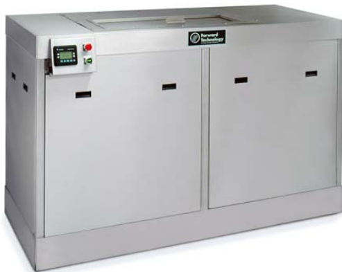
F-300 Standard Version